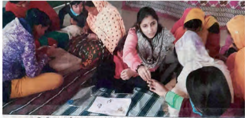
বংশীহারীতে দুঃস্থ মহিলাদের জাংক জুয়েলারির প্রশিক্ষণ দেওয়া হচ্ছে।