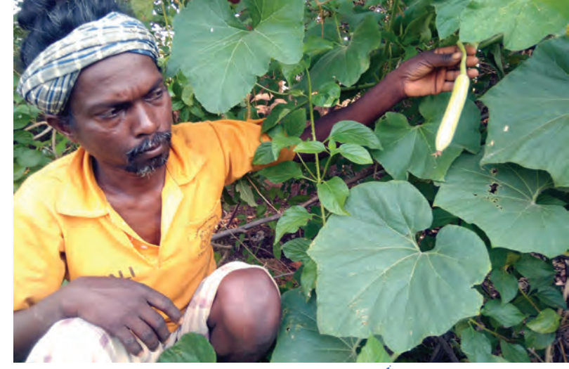
third Wave Foundation

Moving further with focus on integration of the nutrition-sensitive farming practices with the overall developmental priorities of the area